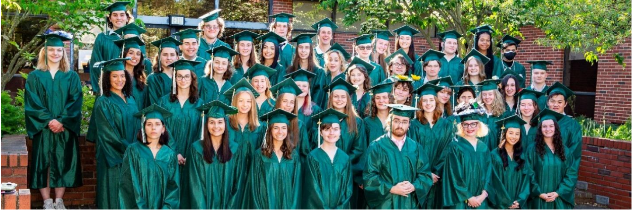
Parker Class of 2022